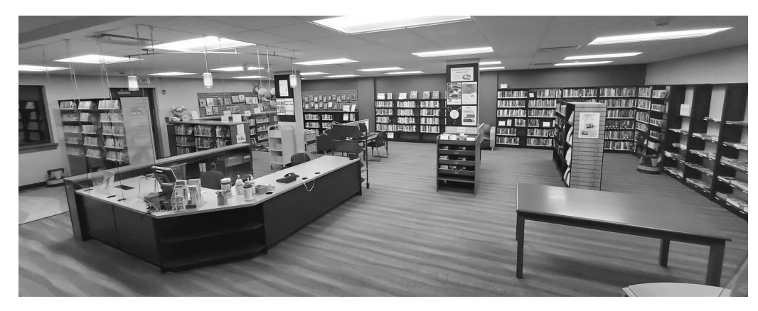
The lower level has been transformed to accommodate browsing new materials for all ages.

The lower level will have the following materials available for browsing: new books, new audiobooks, new music and new movies in all age groups. We'll also have magazines, youth award nominees, and grab bags for all ages. Library patrons must make an appointment to browse these collections or use a computer. Other materials, including books and movies that are no longer new, are currently housed on the upper level and will not be available to browse. The upper level will be closed to the public; please continue to use curbside pickup when checking out older materials.