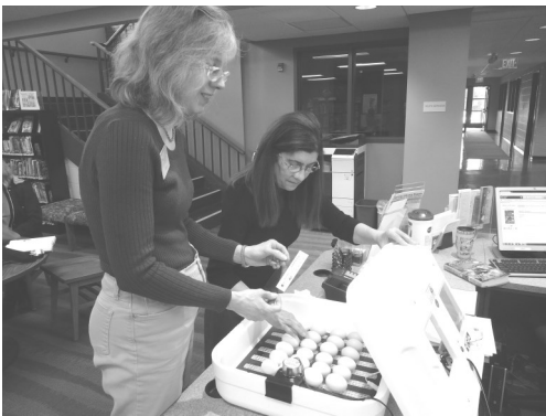
Setting up the incubator

Peep in the children's department to check out the new eggs, and later chicks!