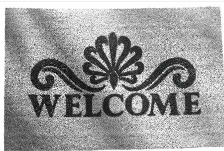
We're rolling out our welcome mat for you on Saturday, December 8 th .

We appreciate the support of patrons of all ages, and we want to reward you! While you are enjoying the open house, don't forget to enter your name in the Adult or Children's Services drawings to win one of two gift baskets.